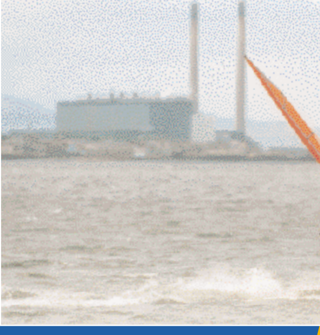
Cockenzie ... pictured from left, the coal sto capacity to hold around 900,000 tonnes, a station from Cockenzie harbour and the co the nerve centre of the plant.

operation and tells the operator when there is any deviation from target conditions.